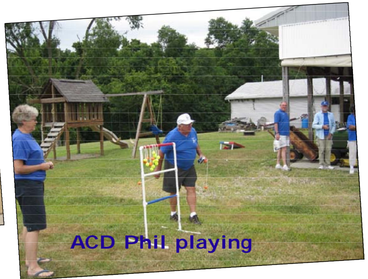
ACD Phil playing