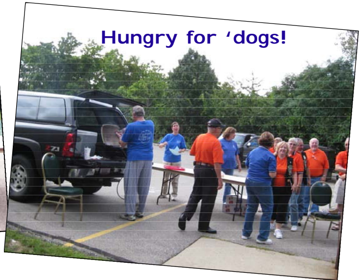
Hungry for 'dogs!